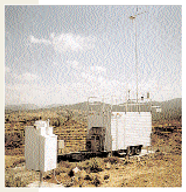
An Ecotech Ambient Air Monitoring installation in Cyprus.